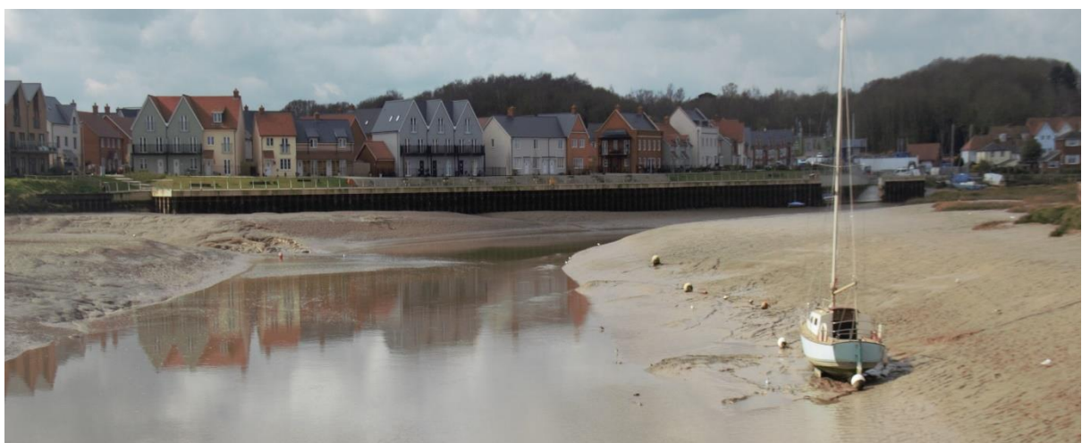
The tide was out, so there was a lot of mud in the river and the boats were marooned.